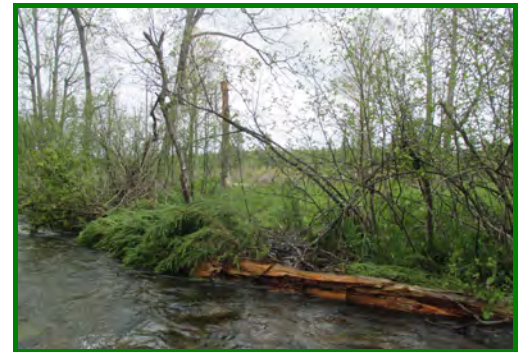
Waypoint 10 - N45.13546/W84.35297 HC-10.4