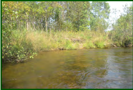
NBL Waypoint 17 - N45°08.976'/W84°19.611' NBL17.05