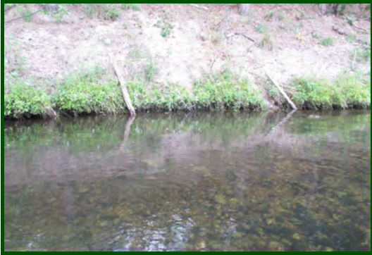
NBL Waypoint 9 - N45°08.988/W84°20.121' NBL 9.05