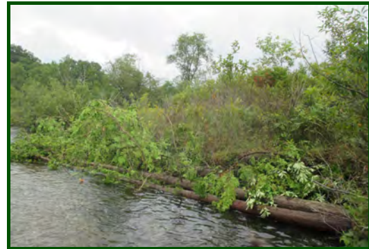
NBL Waypoint 15 - N45°08.949/W84°19.780 NBL15.03