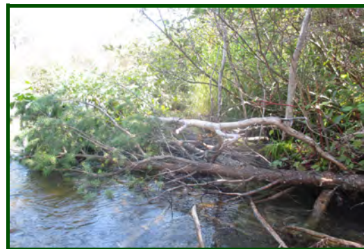
NBL Waypoint 19 - N45°09.011'/W84°19.536' NBL 19.02