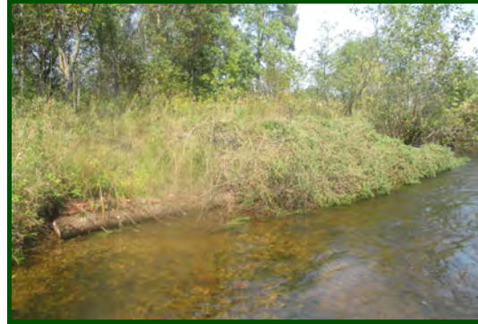
NBL Waypoint 18 - N45°08.998'/W84°19.616' NBL 18.02