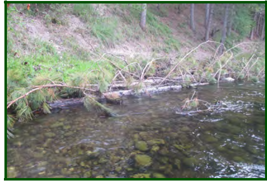
NBL Waypoint 13 - N45°08.883'/W84°19.828' NBL13.01