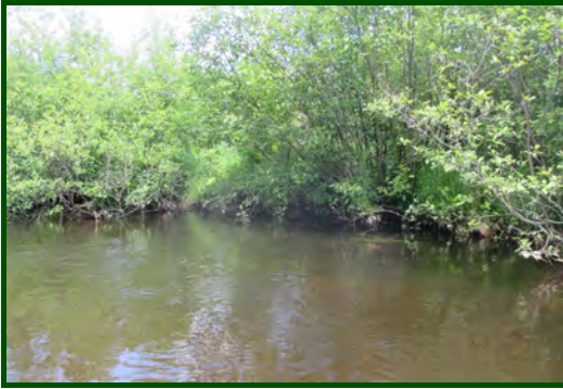
NBL Waypoint 2 - N45°08.843'/ W84°20.368' NBL - 02.01